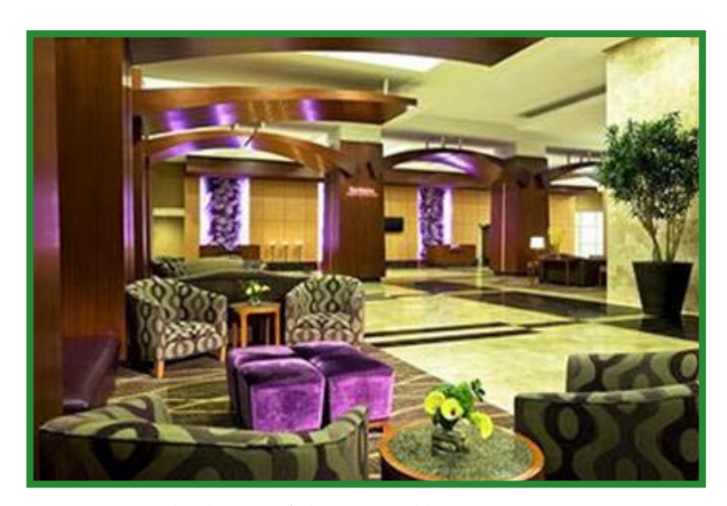
The elegance of the Main Lobby is very inviting

The Westin Hotel Lobby Level Ballroom 70 Yorkville Shopping Center Lombard, Illinois 60148