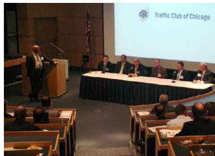
The audience intently listens as panel members respond to questions from the moderator and others regarding issues covering both current and pending CSA legislation.

The committee would like to sincerely thank Harper College and its staff for all the help they gave us in making this a successful event.