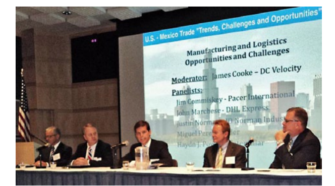
Panel members discuss questions from the audience during the Transportation & Logistics portion of our recent April 25th U.S.-Mexico Trade program held at the Wojcik Conference Center at Harper College.